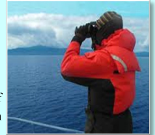
Protected Species Observer

Before a seismic operation begins, visual monitoring is undertaken to check for the presence of marine mammals and other marine species within a specified precautionary, or exclusion zone, often using dedicated marine mammal observers (MMOs) or protected species observers (PSOs).