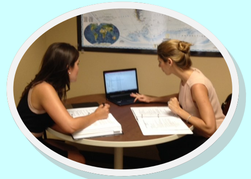
Preparing analysis as part of seismic survey planning

Environmental Impact Assessments (EIAs) are an integral part of developing and implementing a seismic survey. Many countries have environmental impact assessment requirements. The assessments include identification of marine species, including protected species, other environmental sensitivities and the human uses of the proposed area of operations. These assessments are conducted during the survey planning stage and evaluate the potential impacts and risks to marine life. The assessments also identify and consider measures to avoid or mitigate such potential impacts and risks. Seismic surveys are generally considered not to be harmful or damaging to the marine environment. Seismic surveys are comparable to many naturally occurring ocean sound sources, are temporary and transitory and the vast majority are conducted at frequencies below the hearing range of many marine species.